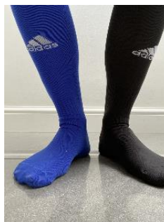
Guess whose legs these belong to!

The school community were wearing odd socks on 16 th Nov, raising money for the Anti bullying charity.